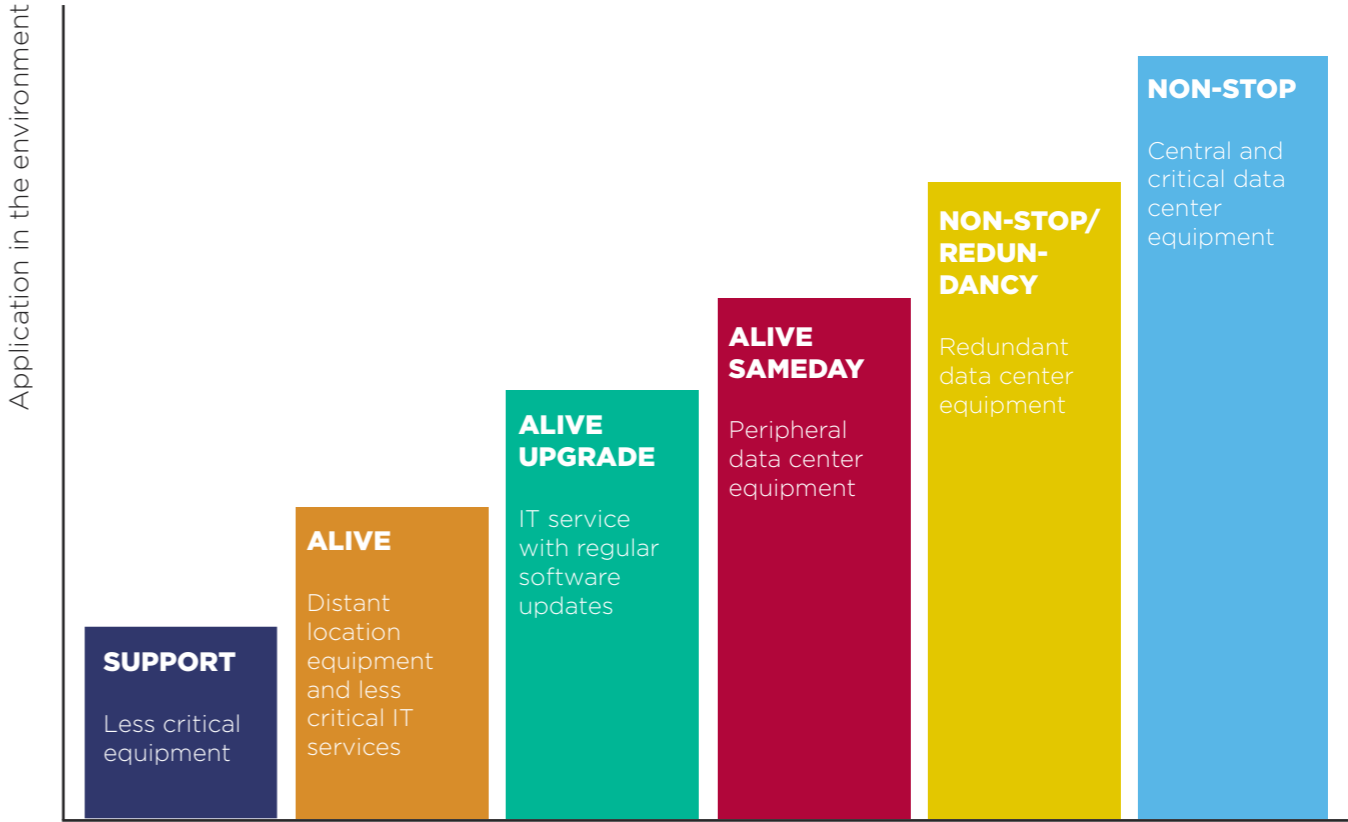
NIL Assist regimes